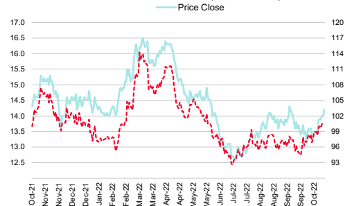
Home Product Center (HMPRO TB)